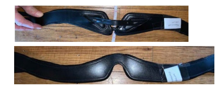
Crownpieces with buckles touching skin, or pressure points such as these are not allowed.