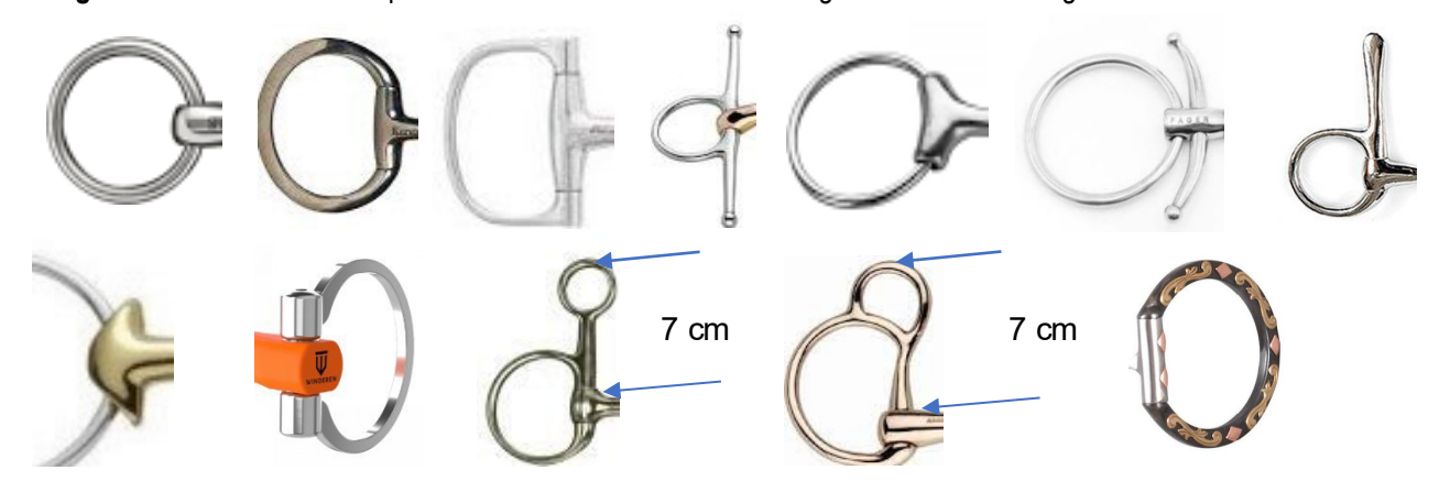
Rings - Diameter of the mouthpiece must be 10 mm minimum at rings/cheeks. These rings are allowed:

Below are some that are similar to the above but are not allowed: