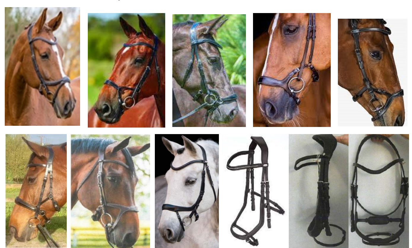
1. PS of Sweden Jump Off 2. Collegiate Comfit Fit 3. Tota Comfort Dropped Noseband 4. PS of Sweden Pioneer 5. Artemis Victory 6. Jeffries Gentle 7. PS of Sweden Nirak 8. Equitas Alpha 9. Buhler Anatomical 10/11. Elite Artemis Advance (with pressure relieving crownpiece)